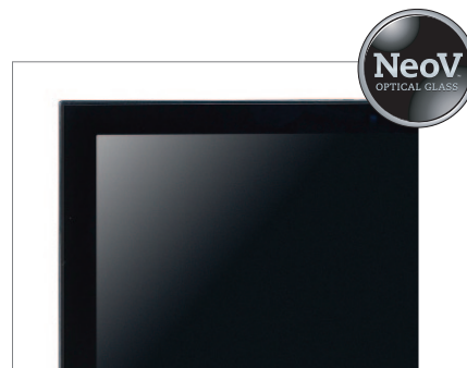
NeoV™ Optical Glass protects against scratches, impacts and other physical damage