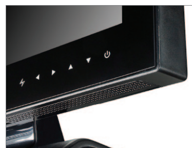
Durable, long-lasting touch sensor controls won't wear out like mechanical buttons