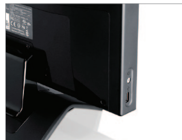
Side-mount headphone jack, USB port and built-in stereo speakers for multimedia convenience