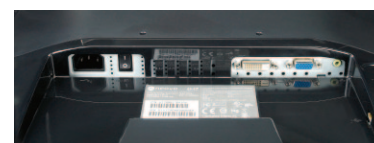
Slash power bills and CO 2 emissions by up to 50% (67% versus CRTs); EcoSwitch cuts power usage to zero when off