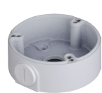
PFA135 Junction box